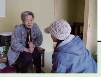
4 His mother is resting in the Japanese style room.