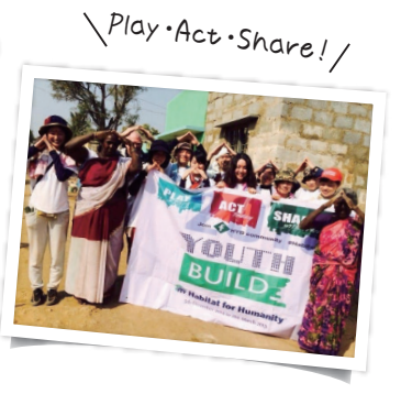
Students from Kyoto University of Foreign Studies organized a GV trip to India