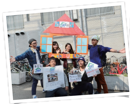
Street fundraising was carried out in various parts of Japan

In addition, students organized charity events and nationwide street fundraising activities.