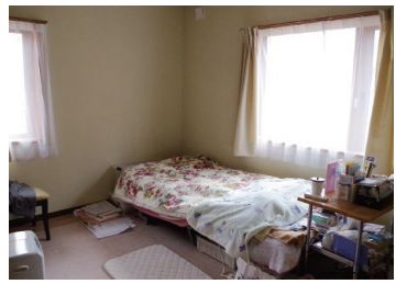
5 The bedroom is full of natural sunlight.