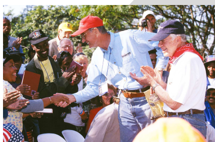
With children in South Africa (2002)

Jimmy and Rosalynn Carter's involvement with Habitat for Humanity International began in 1984