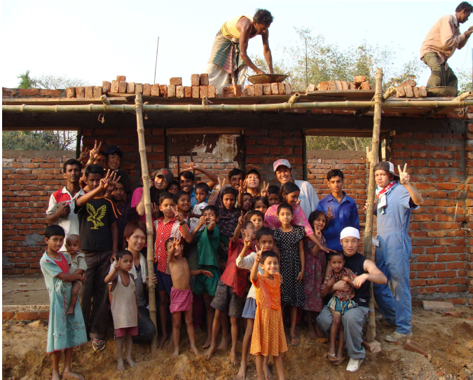
With the children at the building site