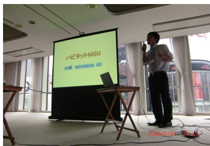
Presentation made by MGU CC

D ow Chemical is a socially conscious and active company globally. The company also has a long relationship with Habitat, and