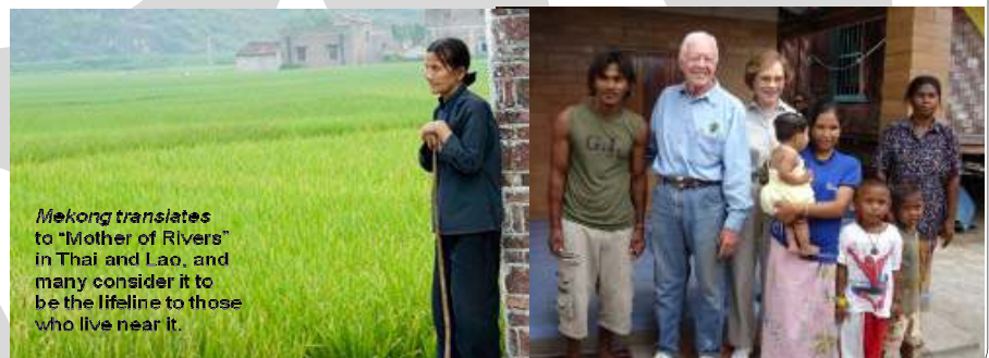
Mekong translates to "Mother of Rivers" in Thai and Lao, and many consider it to be the lifeline to those who live near it.