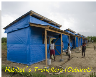
Habitat's T-shelters (Cabaret)

A widespread cholera outbreak has compounded the suffering of families. Habitat and its partner All Hands Volunteers (AHV) have build more than 200 latrines and delivered 750 hygiene kits. In addition to them, Habitat is supporting the families to participate in hygiene promotion classes led by AHV that covered household disinfection as well as cholera awareness and treatment. It is now critical to move families as quickly as possible from camps into safe and decent housing.