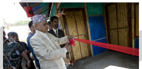
President cutting a ribbon

On the final day, Nepalese President Ram Baran Yadav attended for the closing ceremony and celebrated the completion of the project and future work with Habitat by cutting the ribbon of new houses. Although they were naturally nervous at meeting the President, the homeowner families were able to share their gratitude and many tears of happiness were shed.