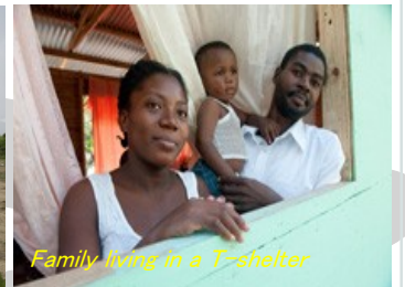
Family living in a T-shelter