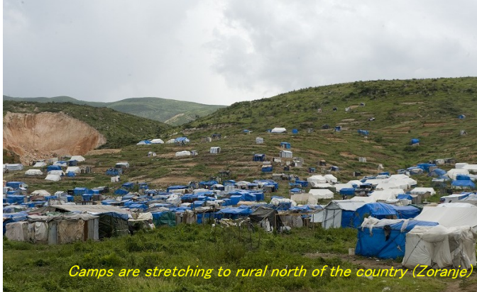
Camps are stretching to rural north of the country (Zoranje)