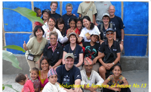
Volunteers & families of house No.13

For October 2nd-8th, 2010, the Everest Build in Pokhara, Nepal united volunteers and families in need and built 40 new bamboo houses in 6 days. This program was undertaken by about 500 international volunteers from eight countries, including Japan, New Zealand, Australia and the USA, alongside 200 local volunteers, being one of the biggest blitz builds in Asia-Pacific region in 2010 as well as the Blue Sky Build in Mongolia. Habitat Japan sent 12 volunteers to join the effort and completed two houses between them, working with Kiwi volunteers. (Shintaro Yamamoto of HFH Japan)