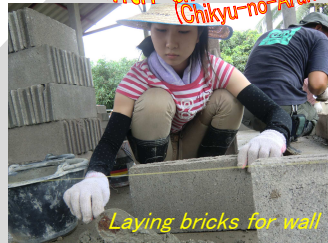
Laying bricks for wall

<From the 1st page>...Habitat Thailand has been building nearly 600 houses in Chiang Mai area since 1998. With the homeowner family and local carpenters, 12 volunteers (among them are 9 students)