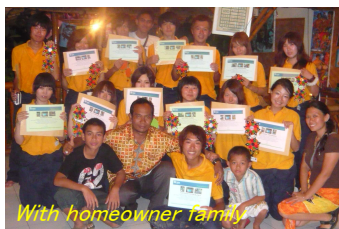
With homeowner family