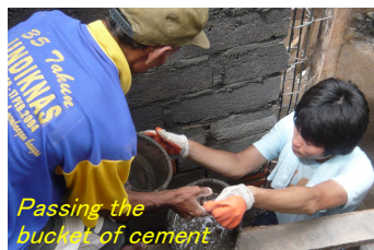
Passing the bucket of cement