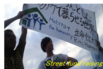
Street fund raising

This summer before joining Bali GV, we did both street fund raising and fund raising from stores. We visited one store to another in Gion area in Kyoto to get a support by showing them our project summary under the heat of midsummer. This is something we could have done because we are students. We are so thankful to be able to visit 67 stores in 2 days and received the financial support from 2 stores. It gave us a valuable experience of learning people's warm heart, the severity of society and also the easy thinking we tend to have. "It would surely be trivial in this summer if we didn't join this GV. Though we'll miss all our work we have done for this Bali in Japan, we'd like to tell what we have learnt among friends and the society" said members of the GV. We'd like to thank everyone who has supported us such as donors, the homeowner family, the local carpenters and the Habitat staffs!