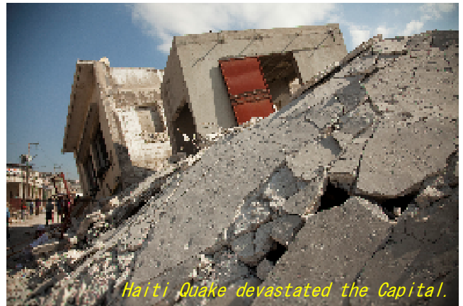
Haiti Quake devastated the Capital.

On 12 January, Haiti was struck by a massive earthquake (M7.0). More than two hundred thousand were killed and made a million people homeless. This tragedy is reported even worse in terms that the quake hit almost only Haiti, an extremely poor nation than the 2004 Indian Ocean Tsunami (14 countries affected, three hundred thousand dead/missing). The dysfunction of the Haiti government made the situation even worse. In response, Habitat started emergency relief, such as the distribution of shelter kits to help affected families rebuild. While distributing the kits, Habitat is putting emphasis more on building homes step by step. (by Shintaro Yamamoto of HFH Japan)