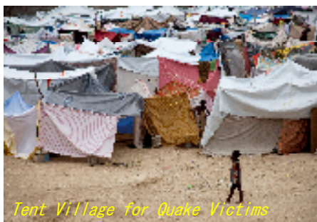
Tent Village for Quake Victims