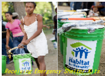
Receiving Emergency Shelter Kits

Each kit contains tools such as shovels, hammers and waterproof sheets, to put families to work making immediate repairs and building temporary shelters. In late March, with the cooperation of volunteers from America and the Dominican republic, 8,000 kits arrived in Haiti. Habitat originally planned to provide 10,000 Haitian families with the kits, plans are underway to further increase the scale of distribution.