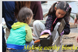
Making earthy blocks