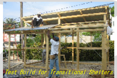
Test Build for Transitional Shelters

been providing aid to Haiti for 26 years, and has built 200 homes in around the capital (2,000 homes across Haiti). Of the 200, only two collapsed due to the quake. Habitat's efforts keep going on to build houses that can save human lives.