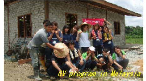
GV program in Malaysia

Ota: Besides taking GV trips regularly, we would like to do some domestic activities. We just started but have been very active with distributing organization brochure during the