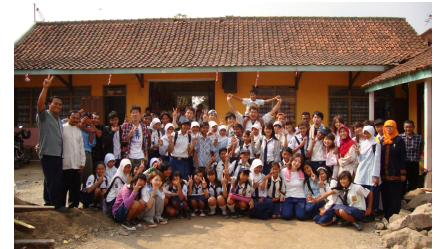
(Right) with Local Residents and staffs