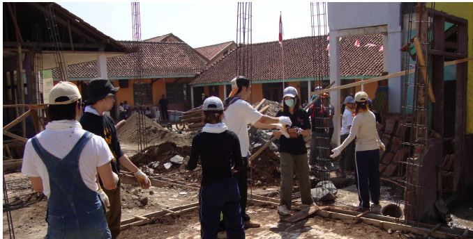
(Above) Elementary School in Building site