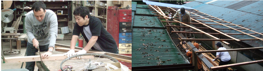
Left above) Working on the Bench, Right above) Working on the Poultry House roof

On Sep 12th, a one-day corporate team build took place in cooperation with an international financial major Credit Suisse at the Asian Rural Institute (ARI) in Nishi-Nasuno, Tochigi.