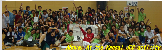
Above) At the Kansai JCC activity